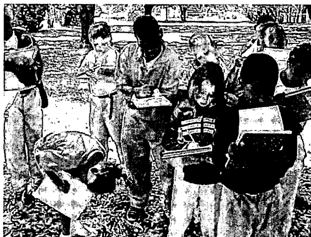
Students from Clinton Elementary record the living and nonliving factors in the oak grove area of their school campus