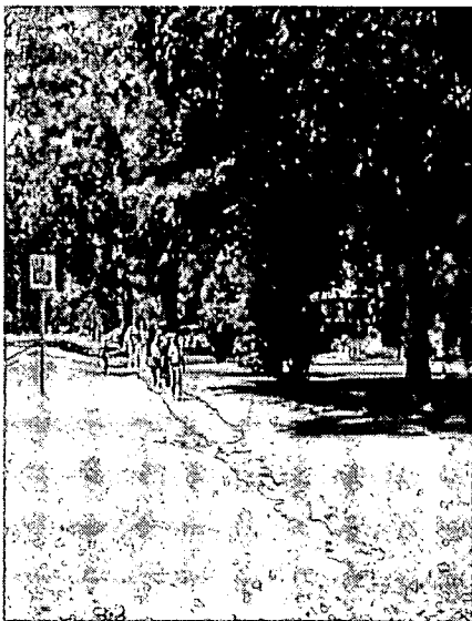
3rd grade students set out to map the town of Slaughter where their elementary school is located.