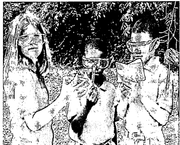
4th graders from Jackson Elementary School conduct water quality tests at McKowen Creek.

Connect, a hands-on math and science program evolving from the Delta Rural Systemic Initiative (RSI) of the National Science Foundation. Since 1999, Project Connect has been expanding into a comprehensive, place-based learning effort through