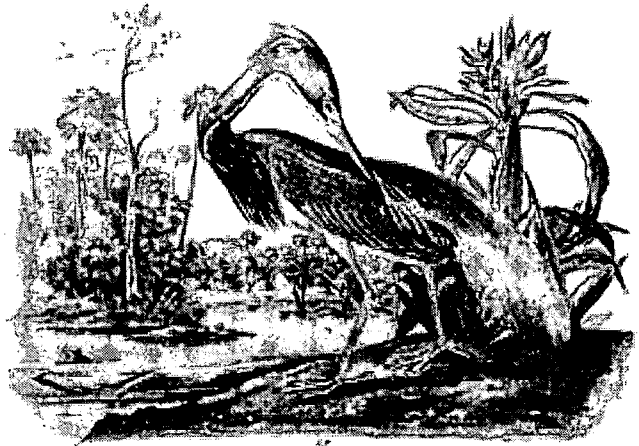
Louisiana Heron John J. Audubon